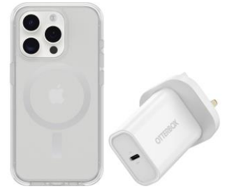
Clear* Type G Plug – White 78-81436 840304774708